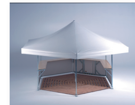
Stackable Wooden Flooring