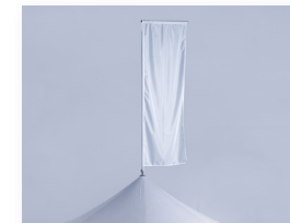
Printable Peak Flags