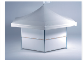
Locking Upper Closure Panels