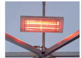
Mounted Infrared Heaters